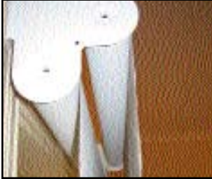
Both Blinds Front Rolled

Thank you for purchasing your blinds from cheapblinds.com.au Your new blinds have been custom built for you from the highest quality materials right here in Australia.