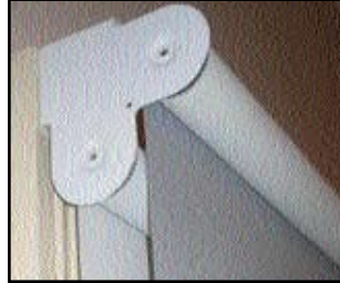
Both Blinds Back Rolled