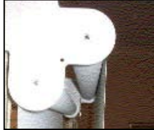
Rear Blind Back Rolled Front Blind Front Rolled

Firstly remove the blinds from the packaging. The installation brackets are supplied in pairs. The installation brackets are always mounted so that the inner surfaces face each other. It is very important that the brackets are mounted so that the blinds are level when installed.